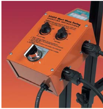
S4000 control box